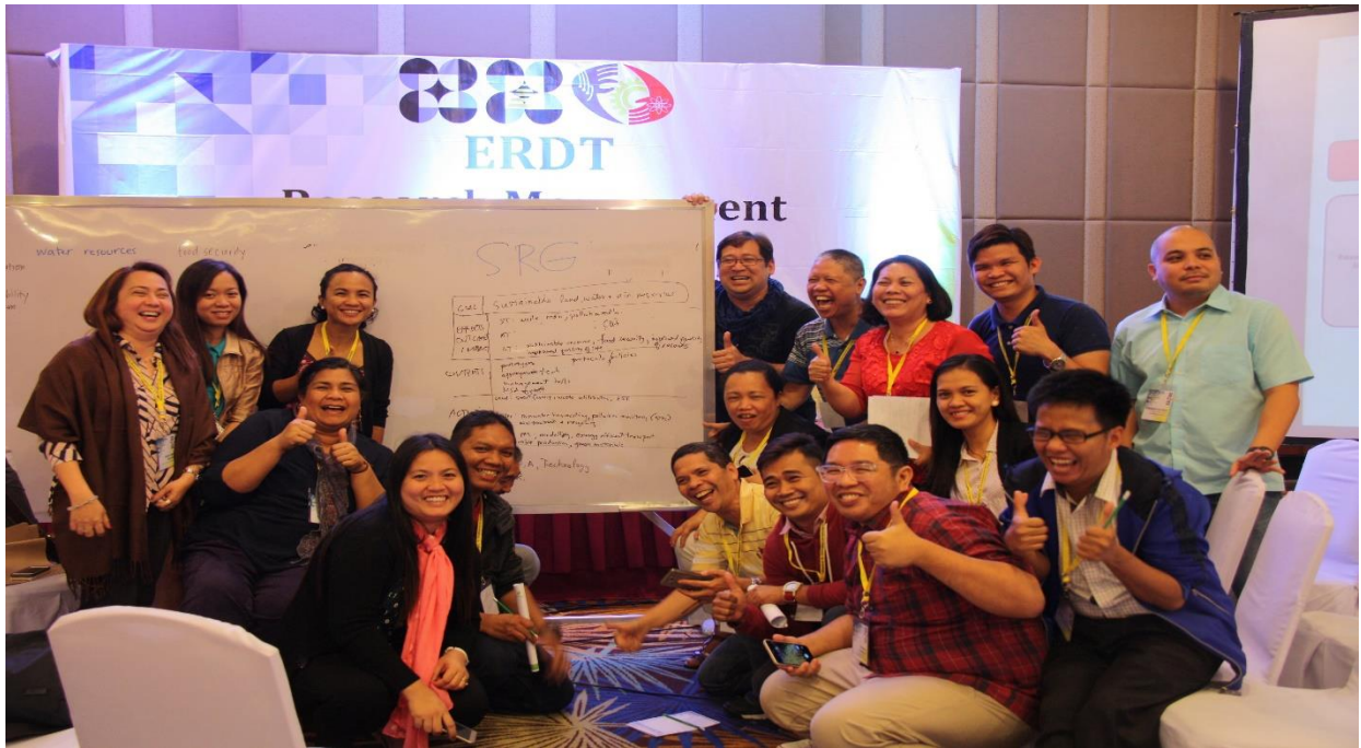
Faculty advisers show approved sign after successfully deliberating their tasks.