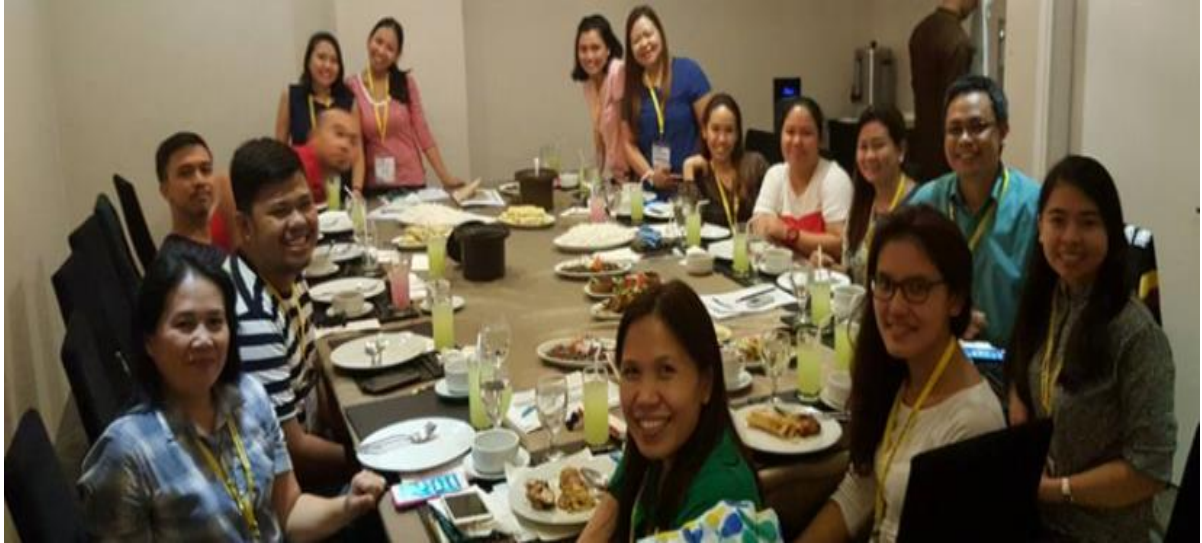
ERDT staff posed for a group picture after the discussion.

In November 24-26, the ERDT held the Project Staff Harmonization of Operations Training at The Oriental Hotel, Albay. The training is aimed at establishing a uniform understanding on the different existing and proposed policies related to ERDT HRD programs within the ERDT consortium, creating uniform mechanisms in managing these programs, creating different means to monitor, update and ensure on-time graduation of scholars, providing trainings to newly hired project staff, and building camaraderie and establishing commitment from all project staff.