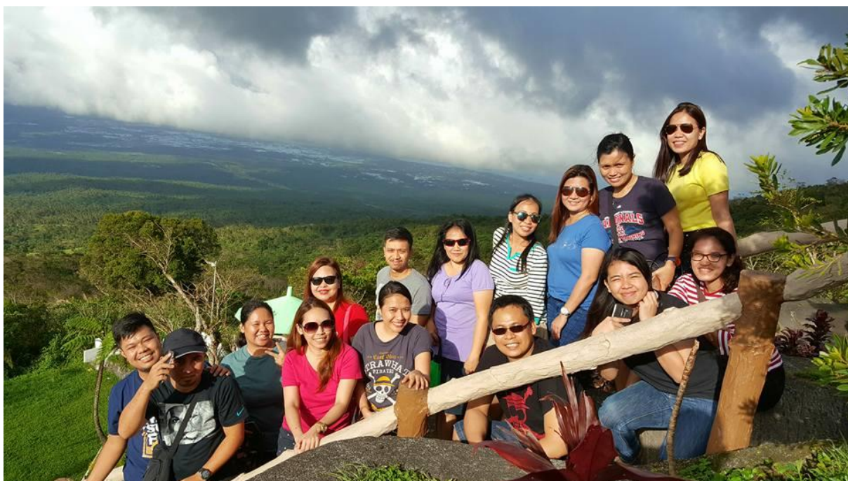
Together, the ERDT staff from the different consortium universities had a brief tour around the area at the end of their two-day training.